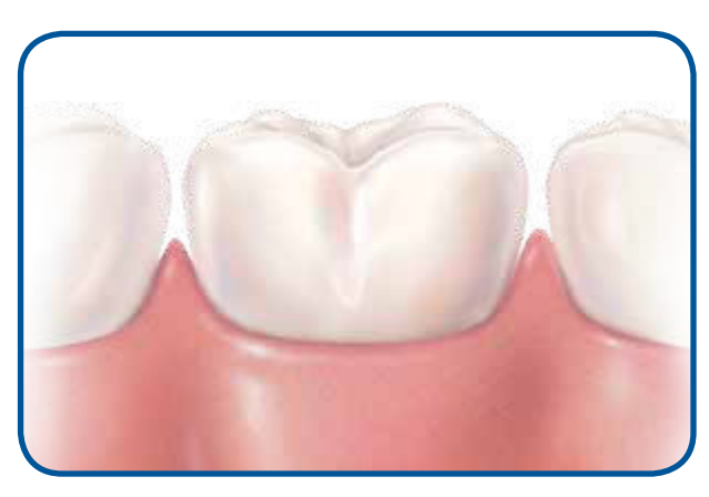
Healthy teeth and gums

The check-up should also include your tongue, throat, face, head, and neck. This is to look for any signs of trouble, swelling, or cancer.