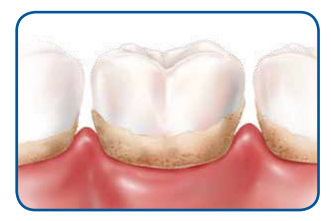
Plaque and tartar buildup