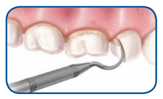
Scaling removes plague and tartar

Brushing and flossing help clean the plaque from your teeth, but you can't remove tartar at home. During the cleaning, your dental professional will use special tools to remove tartar. This is called scaling.